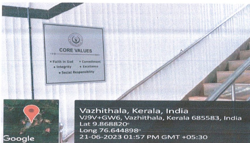
DISPLAY OF CORE VALUES IN CORRIDOR

The administrative staff headed by the Senior superintendent manages the administrative activities of the Institution. Thus, the governance of the institution is initiated by the College Principal and participation of the teaching staff and administrative staff is ensured in all college related decisions.